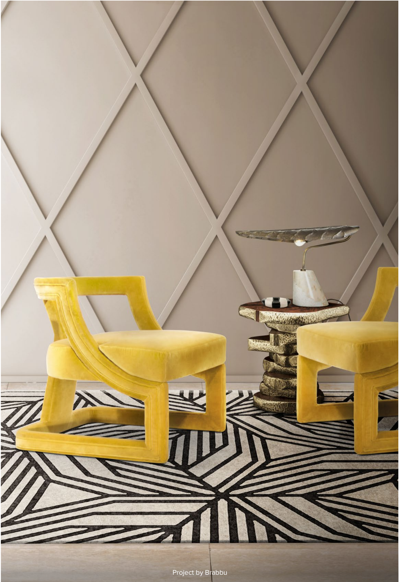
Project by Brabbu