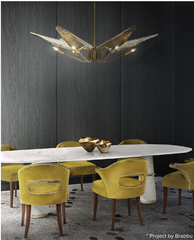
* Project by Brabbu