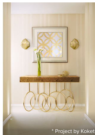
* Project by Koket