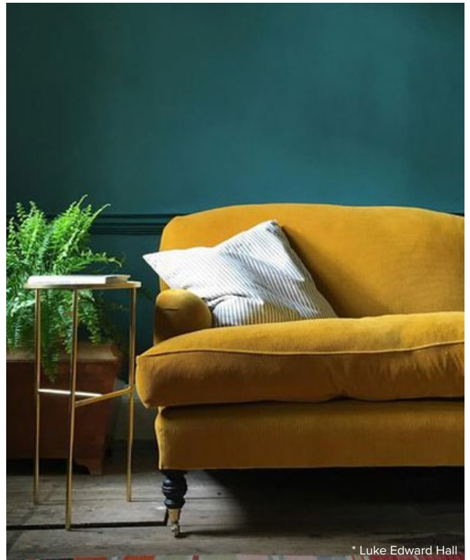
* Luke Edward Hall

Soft hues of yellow can often make your room look even bigger than it is, and it's even possible to make the yellow stylish with stripes, patterns and more.