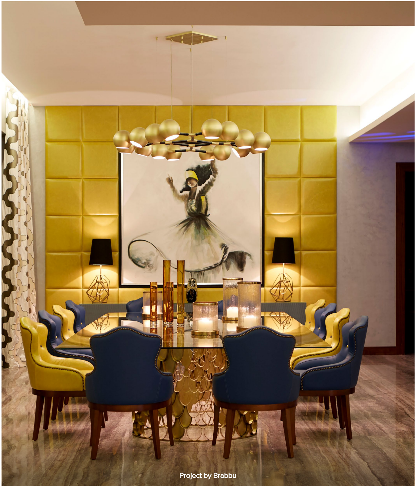
Project by Brabbu

Despite the fact that many interior designers pass yellow as a difficult color to work it, yellow is easy to use as an complementary to other colors. It brings out the brightness of blues, greens, grey and even black – which is why many interior designers choose statement pieces to bring out the quality of the room.