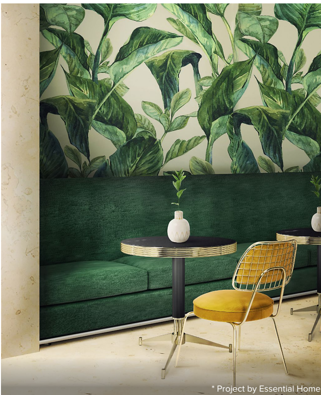
* Project by Essential Home

Soft hues of yellow can often make your room look even bigger than it is, and it's even possible to make the yellow stylish with stripes, patterns and more.