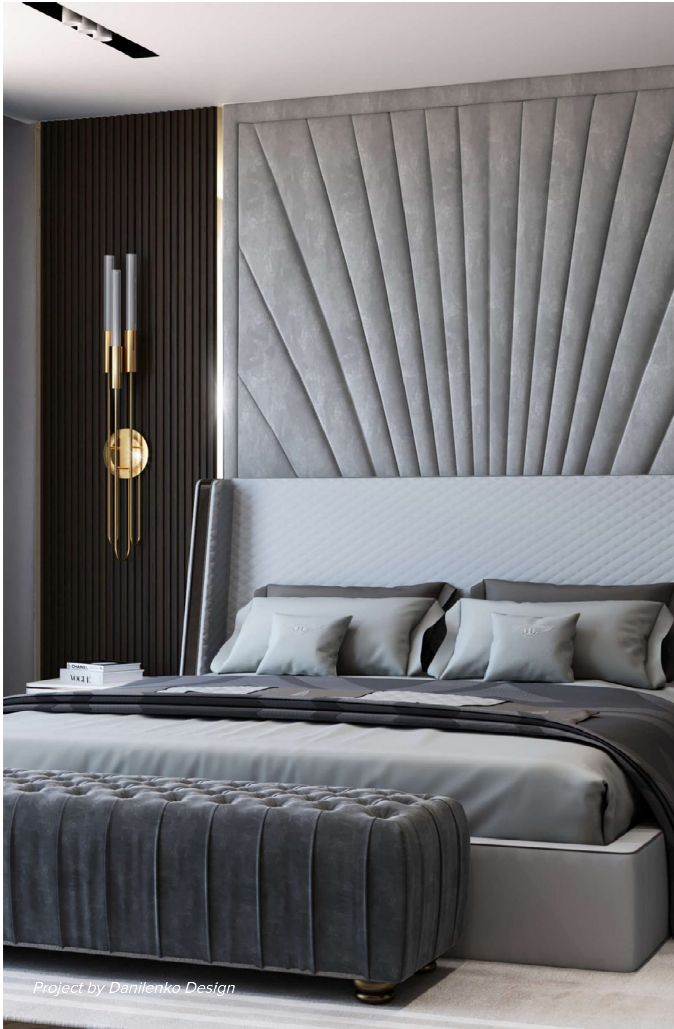
Project by Danilenko Design